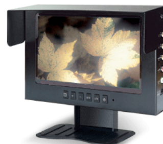
8.5" Heavy Duty