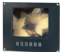
6" Heavy Duty